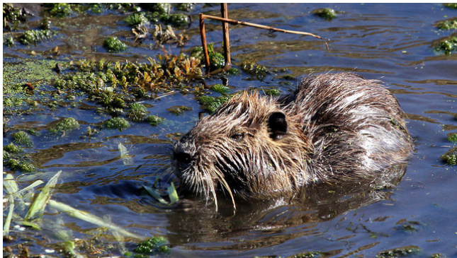
By converting marshland into open water, the invasive Coypu ( Myocastor coypus ) can undermine the ability of coastal wetlands to control floods. The effective control and eradication of the species therefore increases the resilience of wetlands to climate change.

Biological invasions are among the top drivers of biodiversity loss and species extinctions across the world. A 2016 study published in the journal Biological Letters , showed that IAS are the second most common threat associated with species that have gone completely extinct since 1500.